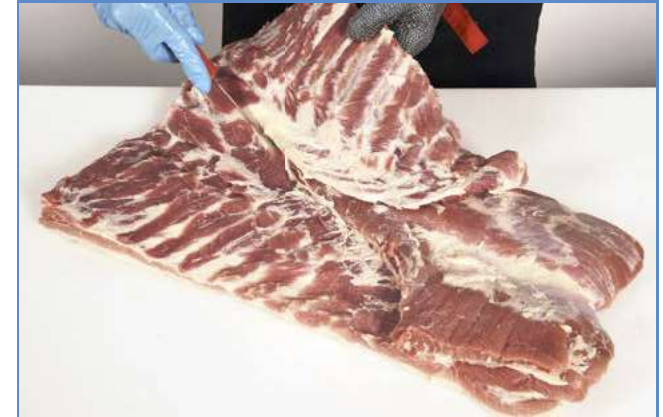
3 Remove ribs and cartilage by sheet boning.