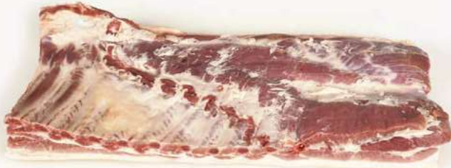
1 Bone-in Belly