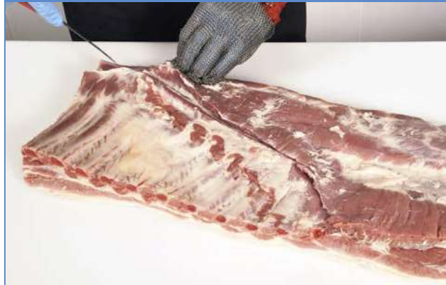
2 Remove breast bone (sternum) and expose rib cartilage.